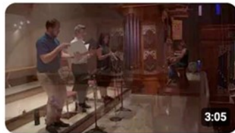
Appalachian Lord's Prayer - Sowash 2 views • 1 day ago

Another new space is on Central’s YouTube channel. You can find our YouTube channel here and subscribe to the channel: https://www.youtube.com/@centrallutheranchurch-euge165/videos .