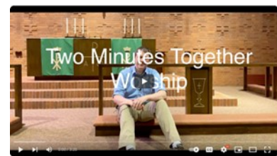
Two Minutes Together - Worship Central Lutheran Church - Eugene, ...

What’s more, we also have original content created just for Social Media. Each week, I create a video devotional called “Two Minutes Together.” This is a very brief devotional to start your week and is based around the upcoming Sunday’s readings.